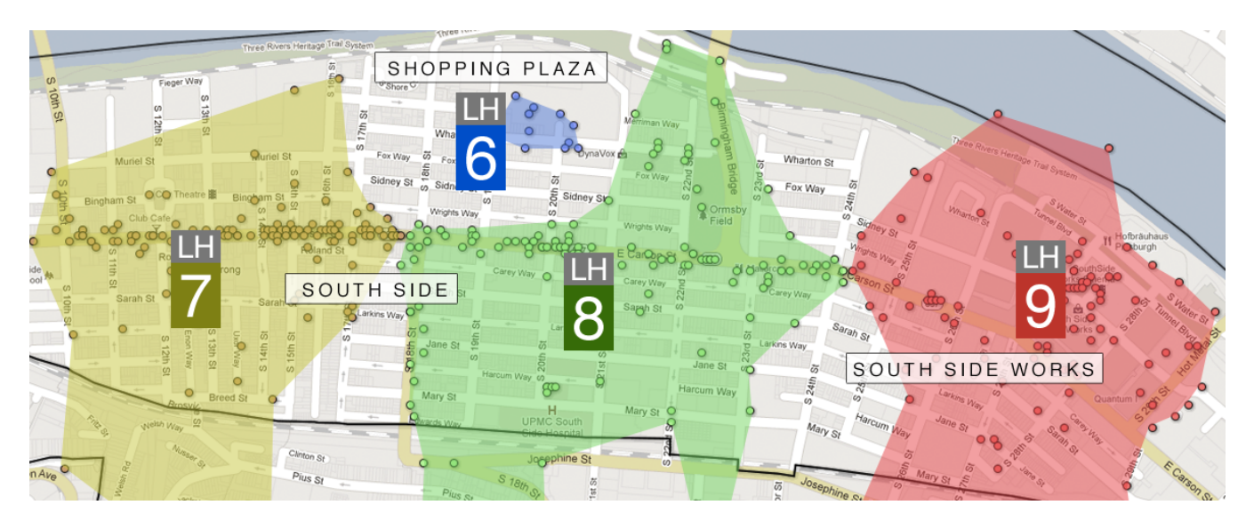
Figure 2: The municipal borders (in black) and Livehoods for South Side.

they go to for entertainment, where they go for food, where they go because they enjoy the walk.